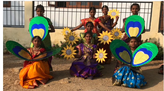
The girls dressed up to be butterflies, danced to welcome the visitors.

Finally, we are back in action with an update, about both the project and how your support is making a difference in the lives of those children and women coming from humble backgrounds.