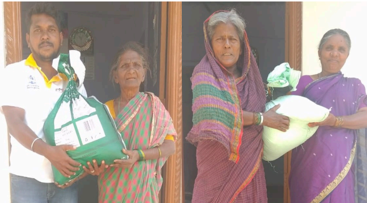
Some examples of food grains and groceries being received with thank you

We are grateful for your prayers and financial support, which has enabled us to assist almost 40 people both in the village and Raichur with some food grains/groceries to survive during the lockdown period. It was a surprise gift for them to receive such support, for which they are grateful to the CRHD